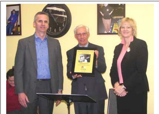
The ServiceSource Foundation funded a state-of-the-art Sensory Perception Center at the Woodmont CIC in FY 08.

Established in 1971, ServiceSource is a regional not-for-profit 501 (c)(3) that provides employment and training services for people with disabilities. ServiceSource has operations in Virginia, Maryland, North Carolina, South Carolina, Colorado and the District of Columbia. ServiceSource is a nationally recognized leader within the disability field, providing quality jobs and support services to people with disabilities.